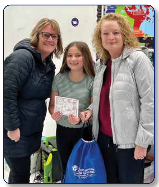
CFCU Christmas card contest winner