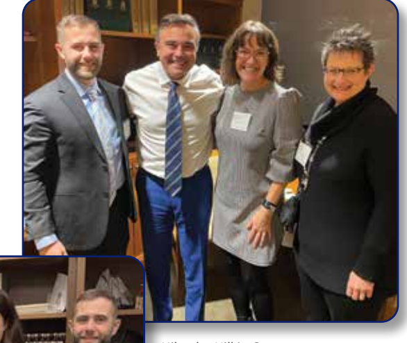
Hike the Hill in Ottawa