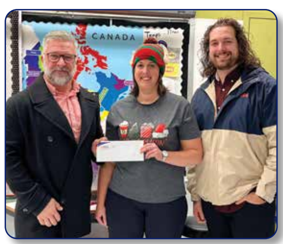
Cheque presentation to Plymouth School