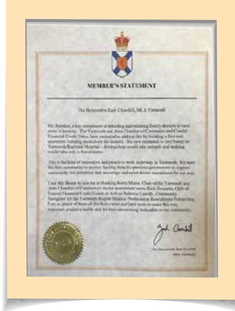
The Honourable Zach Churchill, recognizes the efforts of Coastal Financial Credit Union